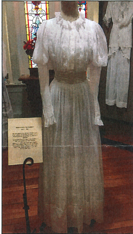
exhibit featuring late Victorian and Edwardian feminine clothing. The clothing is elegant, and all originally owned and worn by Dodge County women.