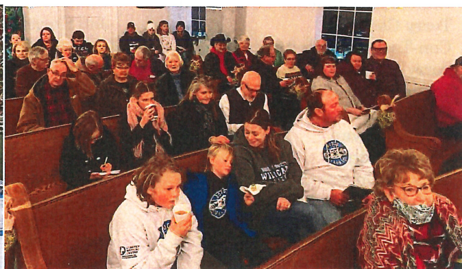
Above, several people gathered for the service at the church in Wasioja.