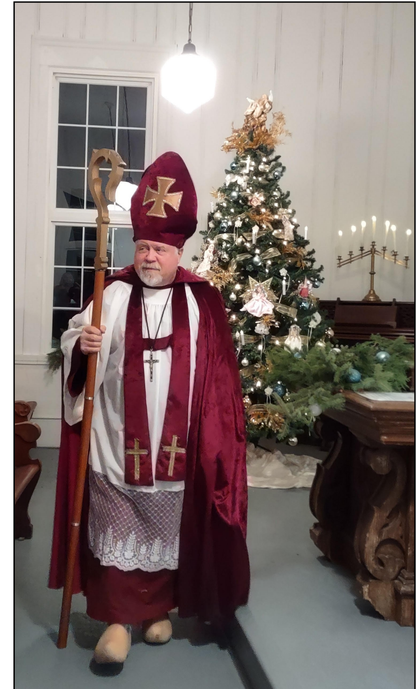
St. Nicholas performed the service at the Wasioja Church on Dec. 11. He also told stories at the open house. See more photos from Christmas in Wasioja inside.