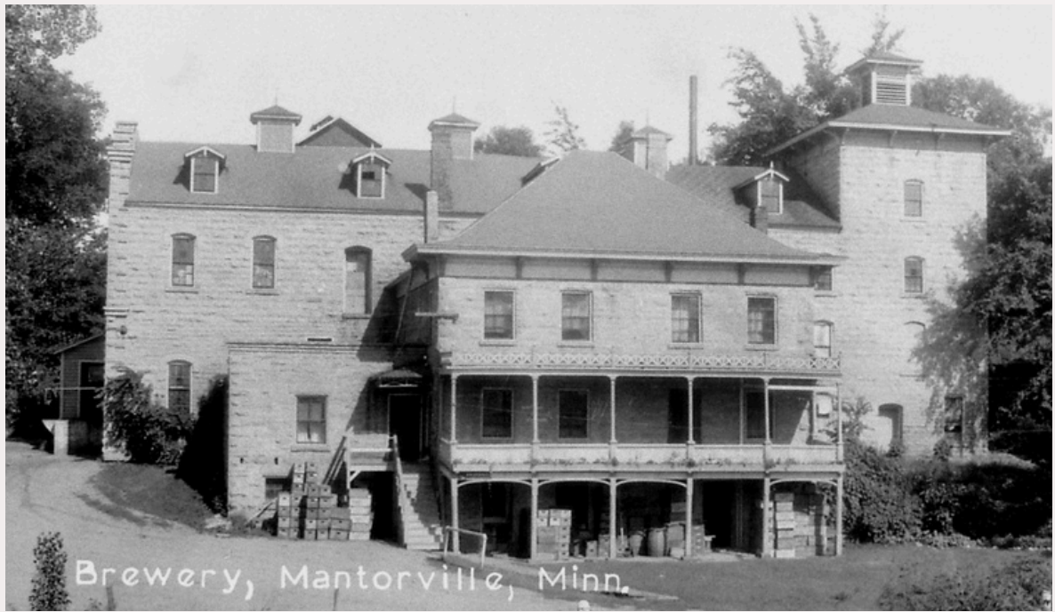
The Mantorville Brewery was four stories tall and produced beverages until 1939. The remains are located one block east of the Hubbell House.

The original building was four stories tall and produced beverages until 1939. The structure was torn down in 1942.