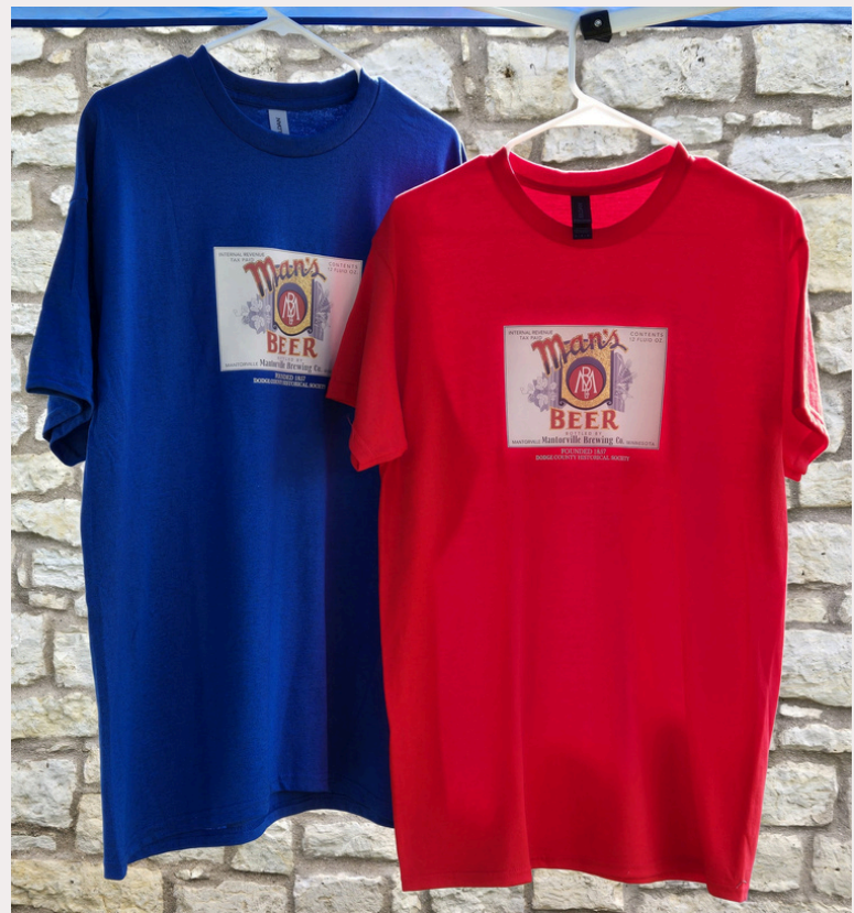
Man's Beer was brewed at the Mantorville Brewery by one of its earliest owners. The Man's Beer T-shirts are a fun way to celebrate Dodge County's colorful past.