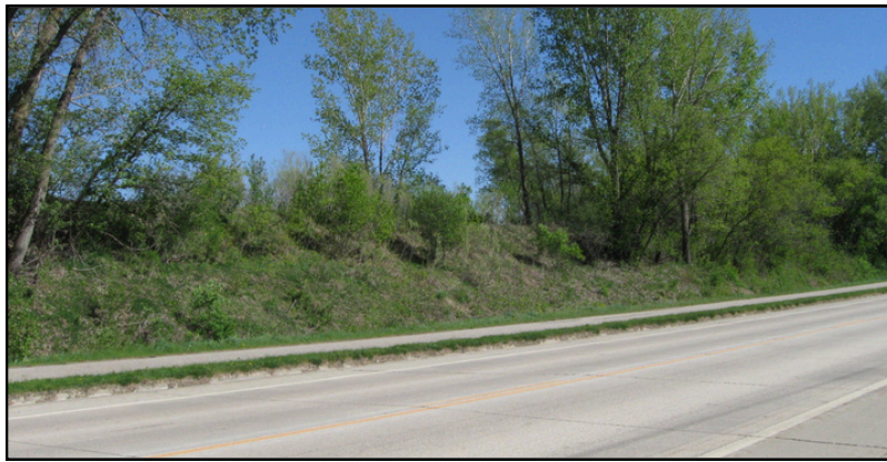
The berm in this picture is an old railroad right of way next to County 21, located south of Mantorville on the dump road and north of the quarry.

The old brewery, the ruins of which still exist in Mantorville, was a primary shipper of goods on this track. I had stated that refrigerator cars were not available in the years