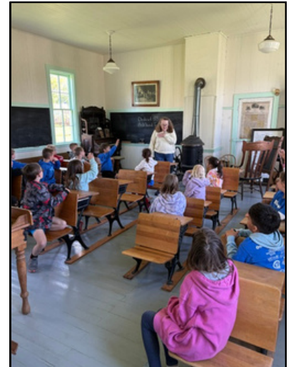
Students danced around a Maypole, churned and tasted butter, learned about inventions and go into a one-room school.